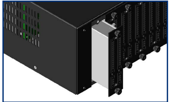
View of ZPU-5000 plug-in modules